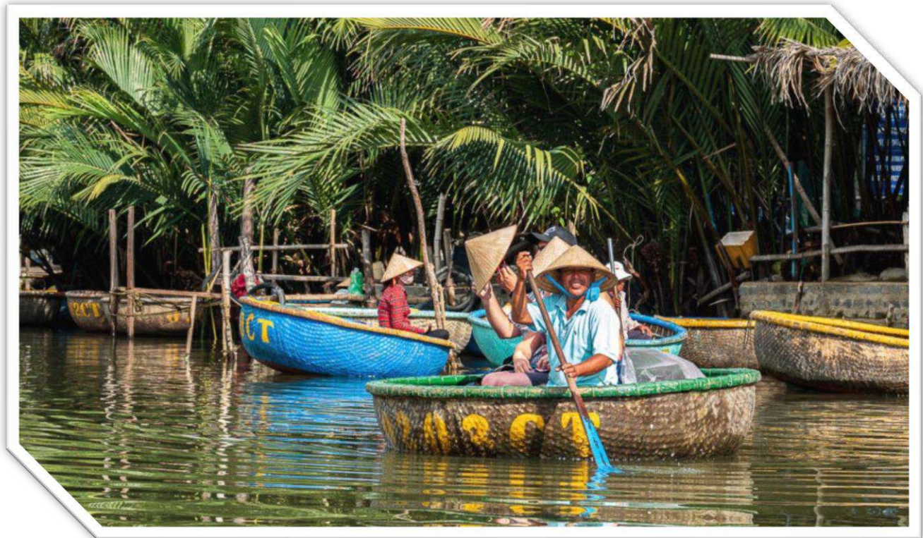
Cam Thanh coconut village